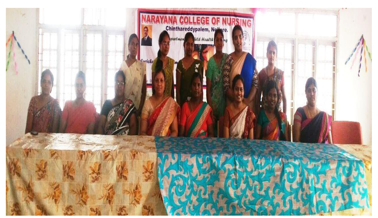
Table 1: Frequency and Percentage distribution of level of knowledge among participants in Pre-test (N=70)

Certificates were distributed to all the participants. Vote of thanks was proposed by Ms. Ruth Grace. M, followed by a National Anthem. The pre and post test results showed that there was enhancement in the knowledge of the students regarding intrauterine fetal surgeries.